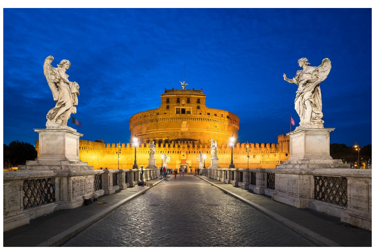
Castel Sant'Angelo (Castle of the Holy Angel) <a href="https://en.wikipedia.org/wiki/Castel_Sant%27Angelo">https://en.wikipedia.org/wiki/Castel_Sant%27Angelo</a>